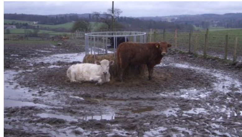
Avoid Concentrated Feeding