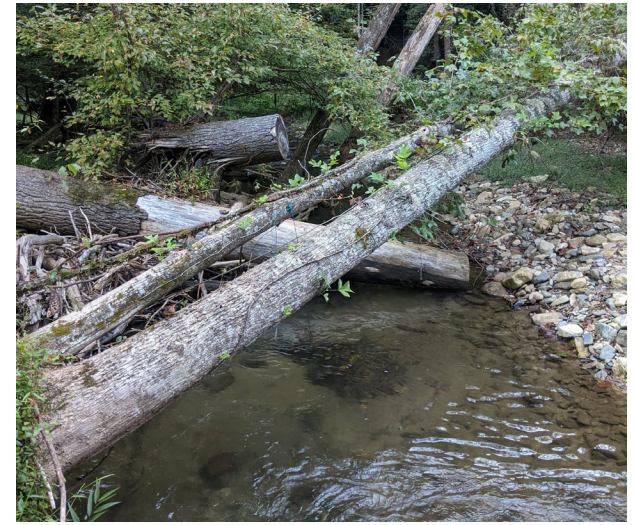
Removing Stream Debris