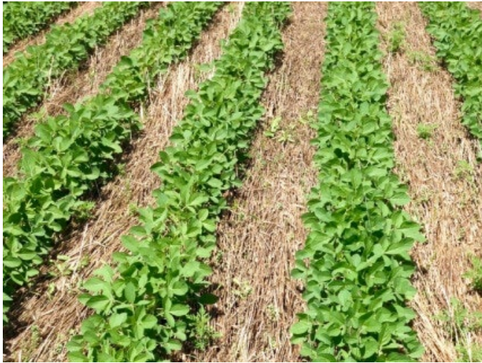
Conservation Tillage or No Till