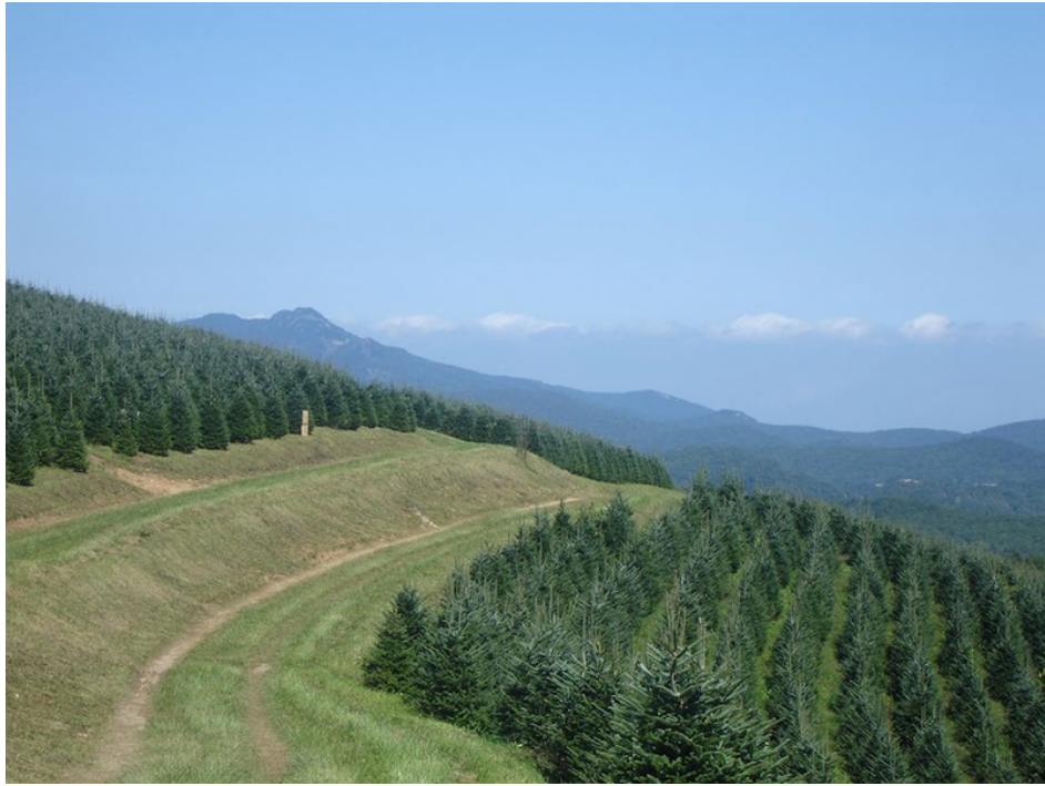
Plan With Water Flow In Mind