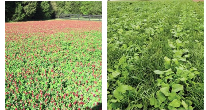
Plant Cover Crops