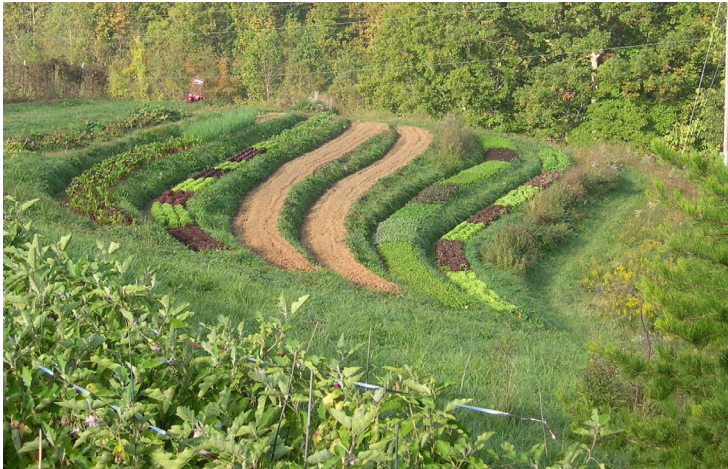
Terrace or Contour Farming