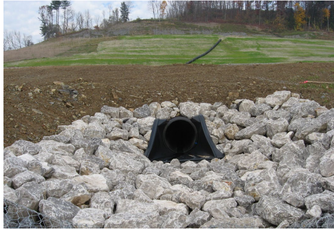
Stabilized Outlets and Water Control Structures