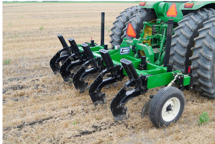
Use a Subsoiler