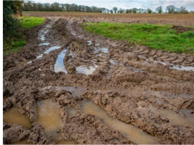
Avoid Working Wet Soil