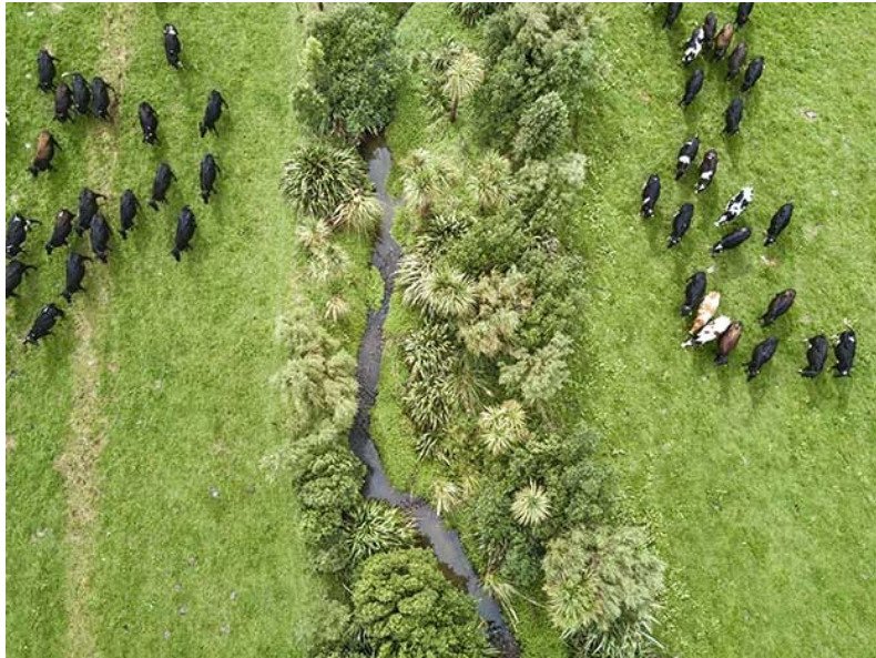
Plant Native Vegetation in Riparian Areas